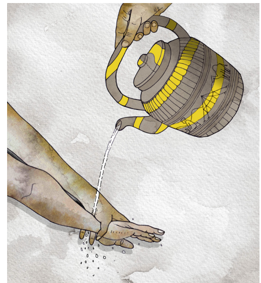
"Washing Hands for Prayer."