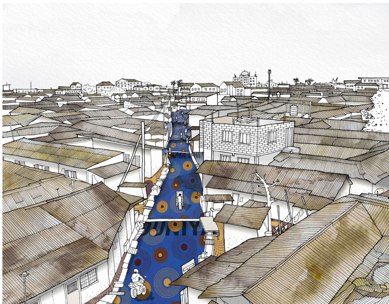
"A Road of Folded Speech."